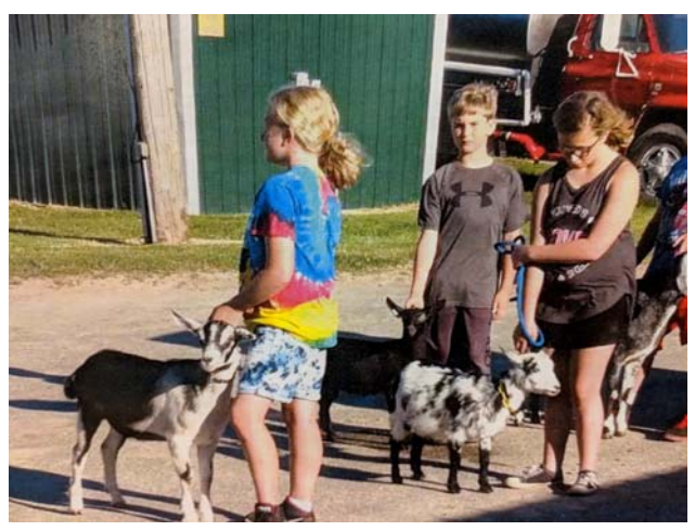
4-H members preparing for showmanship at a small animal clinic