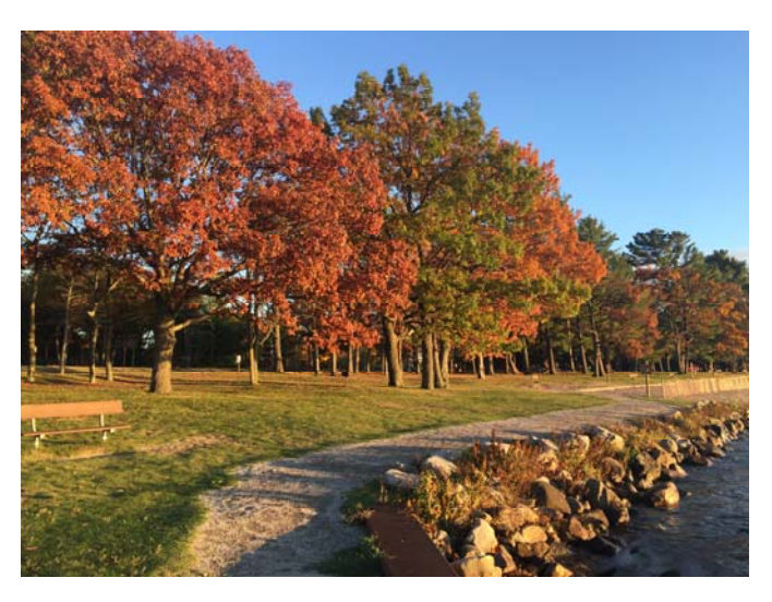
Learning land division law is important for local officials, developers, and property owners.

Providing quality education programs to help residents and businesses keep food safe is a hallmark of cooperative extension services across the country. In Isabella County, we offered classes in food preservation, cottage food law, safe food handling in food pantries, ServSafe, Cooking for Crowds and pressure canner gauge testing. Utilizing partnerships with local organizations helps create environments for successful trainings.