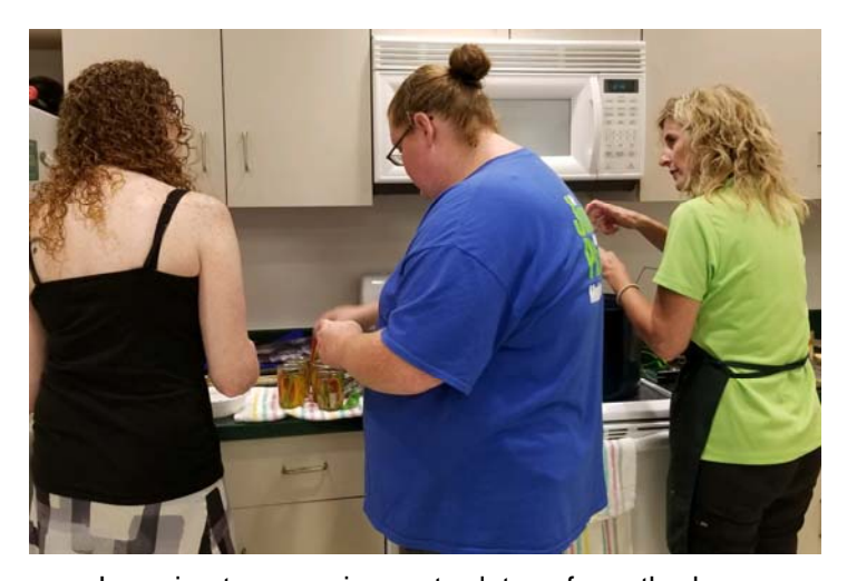
Learning to can using up-to-date safe methods reduces the risk of food-borne illnesses.