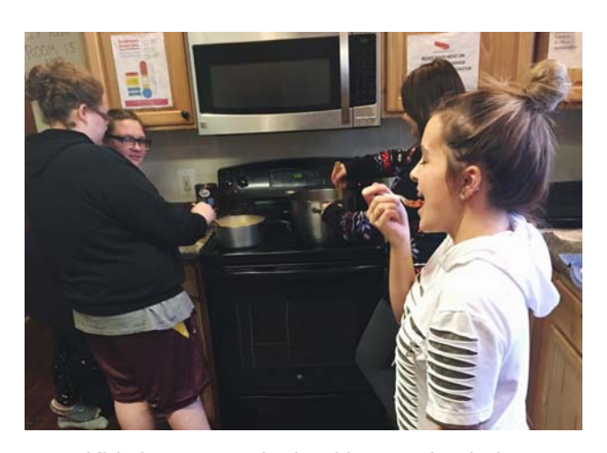
Kids learn to make healthy snacks during "Cooking Matters for Teens."